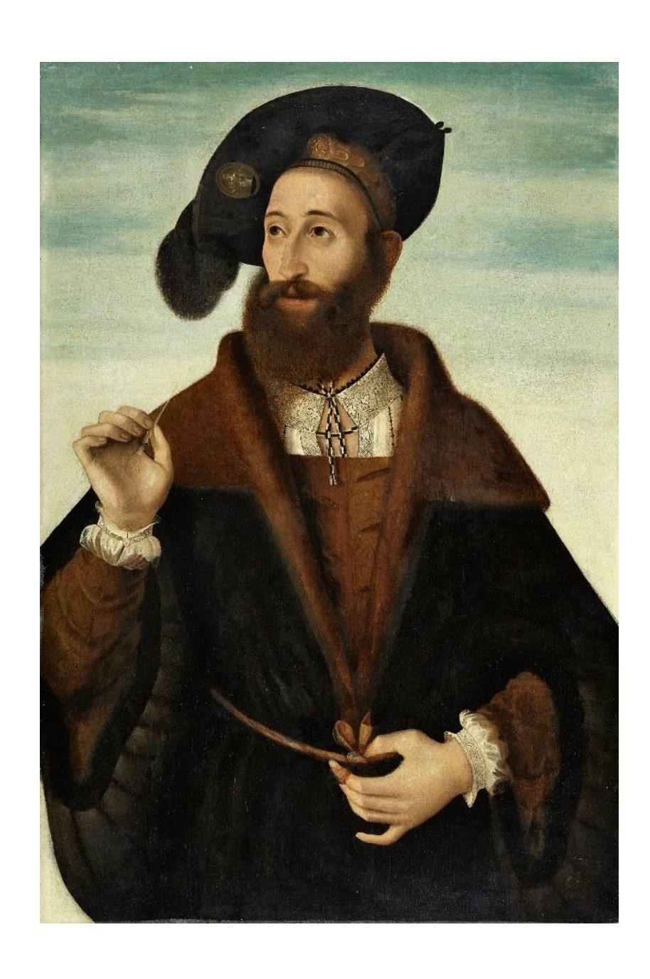
Ficha web (incluye descargable en alta calidad)

Bartolomeo Veneto Retrato de un hombre Hacia 1525 - 1530 SALA 7