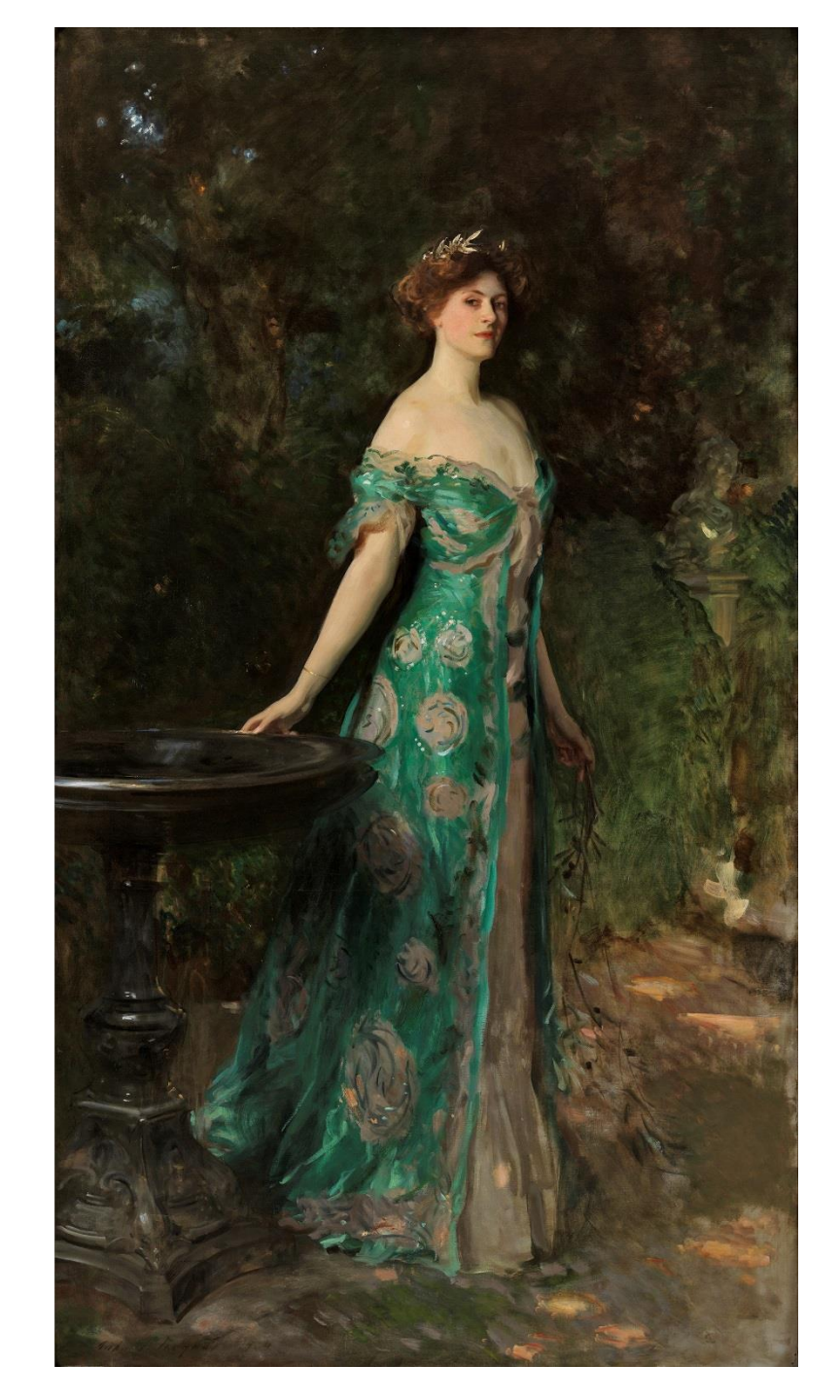
Ficha web (incluye descargable en alta calidad)