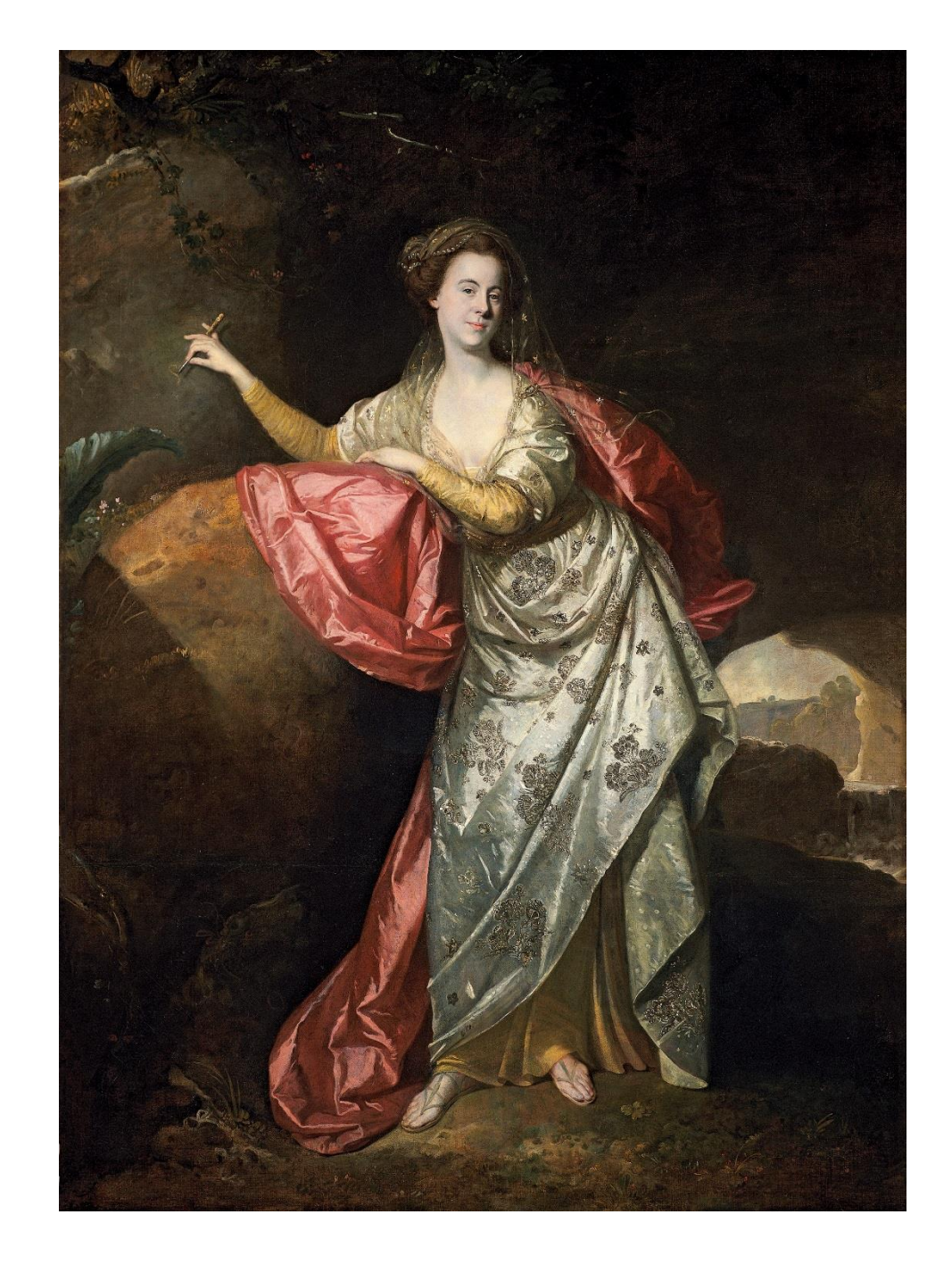
Ficha web (incluye descargable en alta calidad)