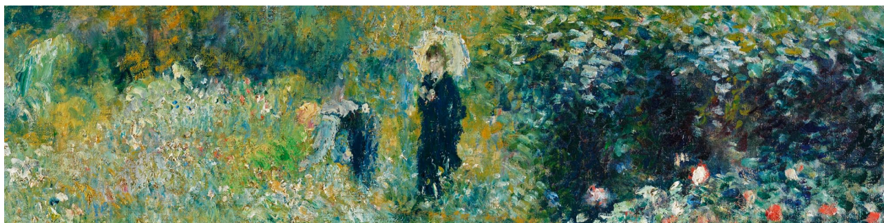
Pierre-Auguste Renoir, Woman with a Parasol in a Garden (detail), 1875, Museo Nacional Thyssen-Bornemisza, Madrid

Paseo del Prado, 8. Madrid (+34) 917 911 370 www.museothyssen.org