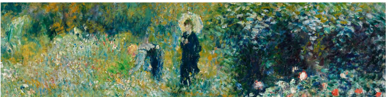
Pierre-Auguste Renoir, Woman with a Parasol in a Garden (detail), 1875, Museo Nacional Thyssen-Bornemisza, Madrid

*As a temporary measure while the health alert lasts, you can buy your tickets online. To visit the temporary exhibition on the ground floor you need to book a time slot.