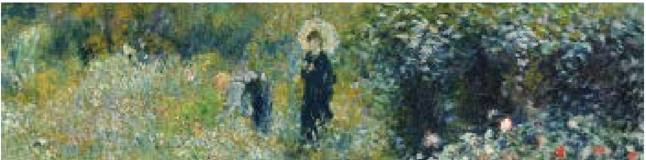
Pierre-Auguste Renoir, Woman with a Parasol in a Garden (detail), 1875, Museo Nacional Thyssen-Bornemisza, Madrid.

*As a temporary measure while the health alert lasts, you can buy your tickets online. To visit the Temporary exhibition level 0 you need to book a time slot.