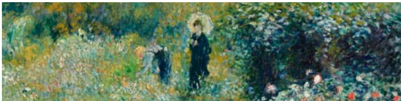
Pierre-Auguste Renoir, Woman with a Parasol in a Garden (detail), 1875