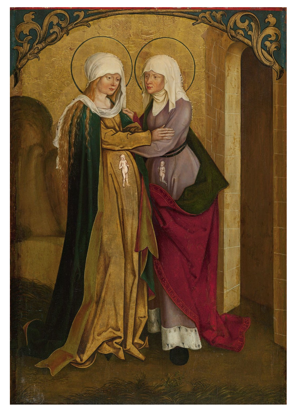
Ficha web (incluye descargable en alta calidad)