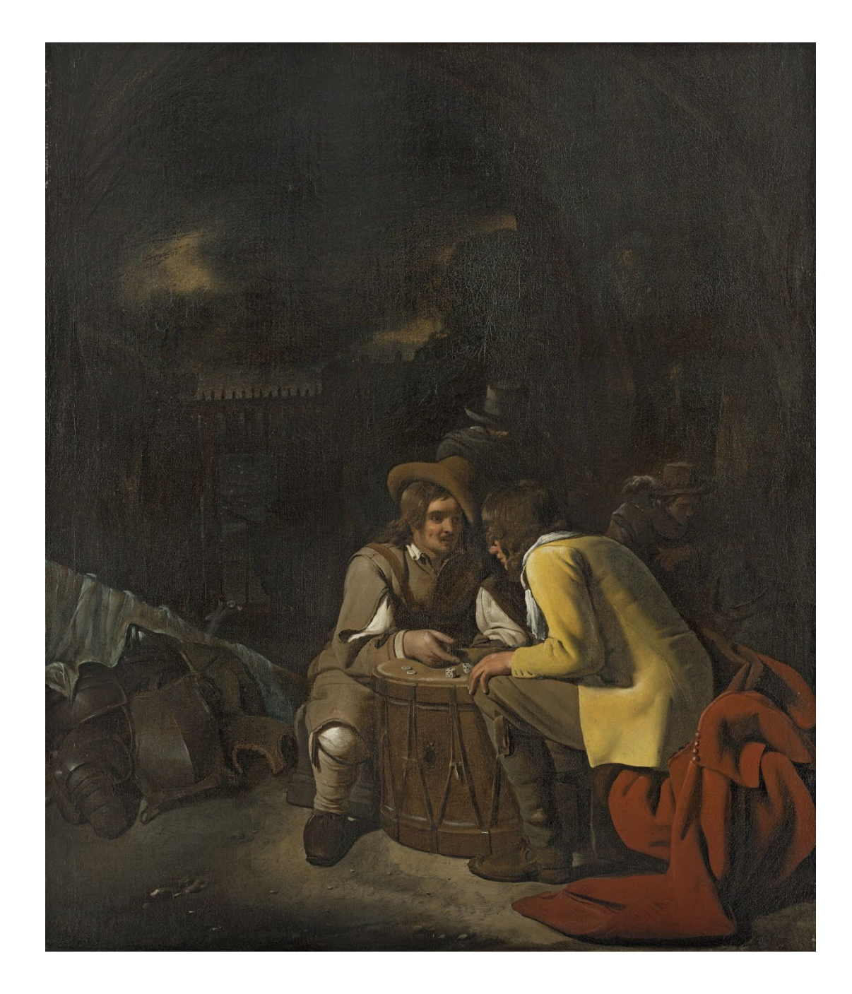
Ficha web (incluye descargable en alta calidad)