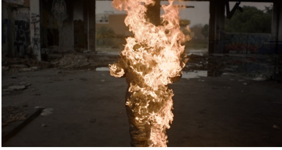
Still from Double Fiction (2021).

In this video the women from Valkiria Stunts, the only female stunt team in Spain, act out scenes in which the double was originally a man, thus championing their presence in the film industry.