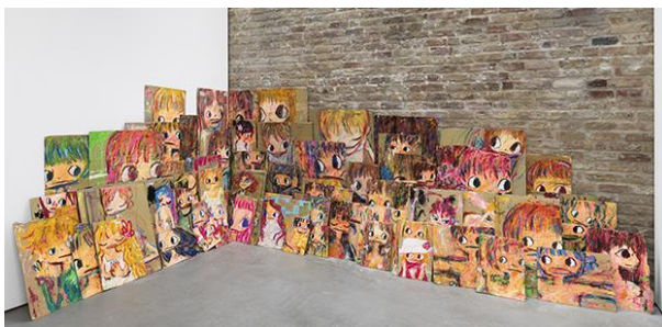
Untitled, 2001-06.

In 2011 Rokkaku moved from Japan to Berlin where she started to use pencil and crayons and also employed more childlike lines in her compositions with the aim of maintaining both a child's gaze and the world of childhood. Interested in Abstract Expressionism and artists such as Jackson Pollock and Cy Twombly, whose work she had encountered years before in New York, she now placed more importance on abstract backgrounds in her paintings, in addition to figures or motifs applied to them. Playing with several layers, Rokkaku started adding colours and shapes in front of and behind a principal figure. Multicolored clouds now start to appear in these backgrounds, one of the natural elements most present in the work of this artist, who is attracted to their changing shapes.