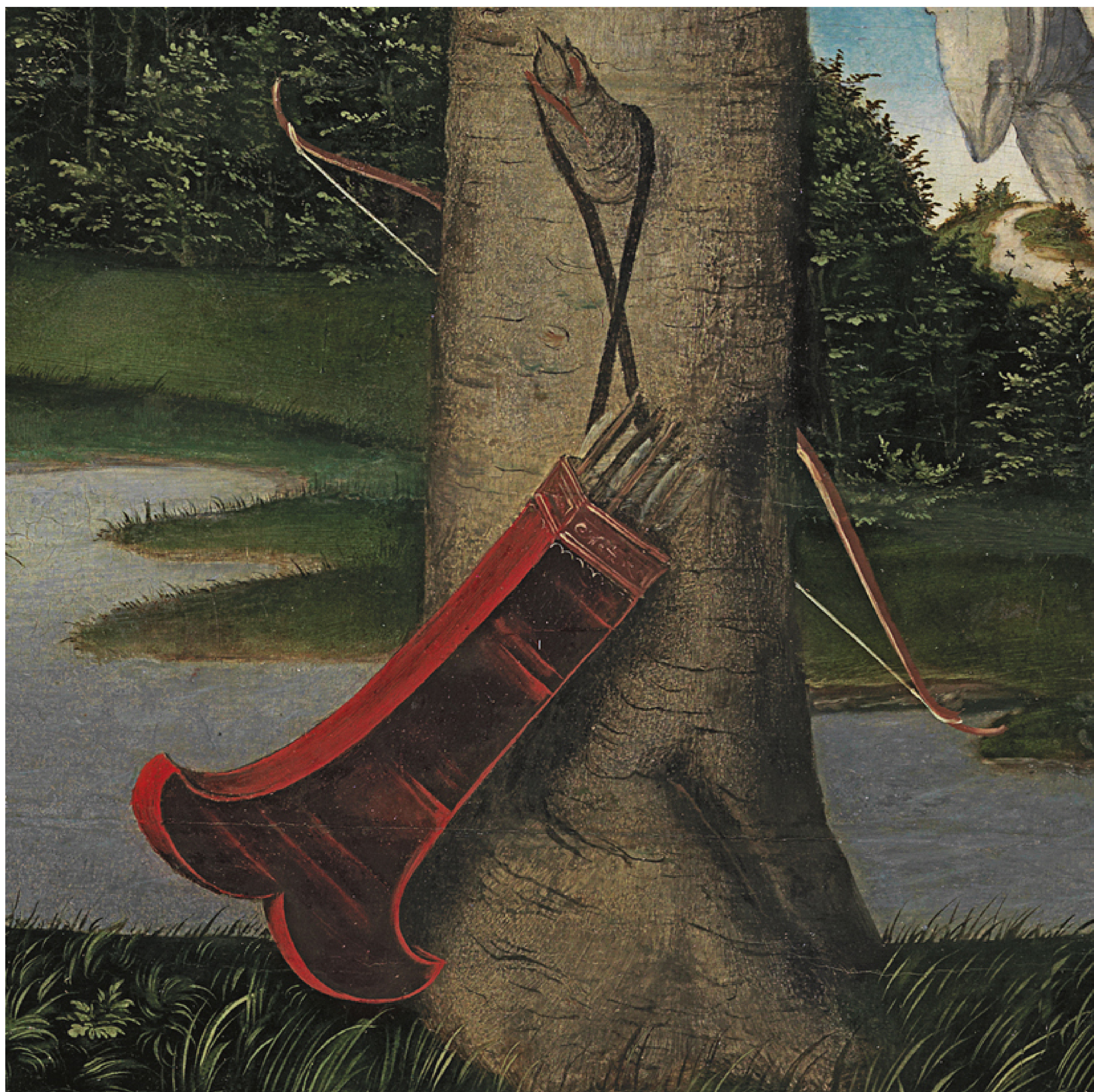
Detail of The Nymph of the Fountain , circa 1530-1534, by Lucas Cranach the Elder Thyssen-Bornemisza National Museum