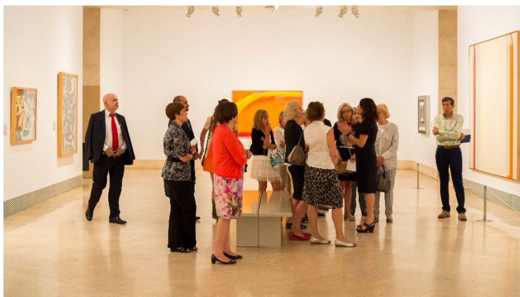
Tours of the Thyssen-Bornemisza permanent collection and the Carmen Thyssen collection during the museum opening hours.