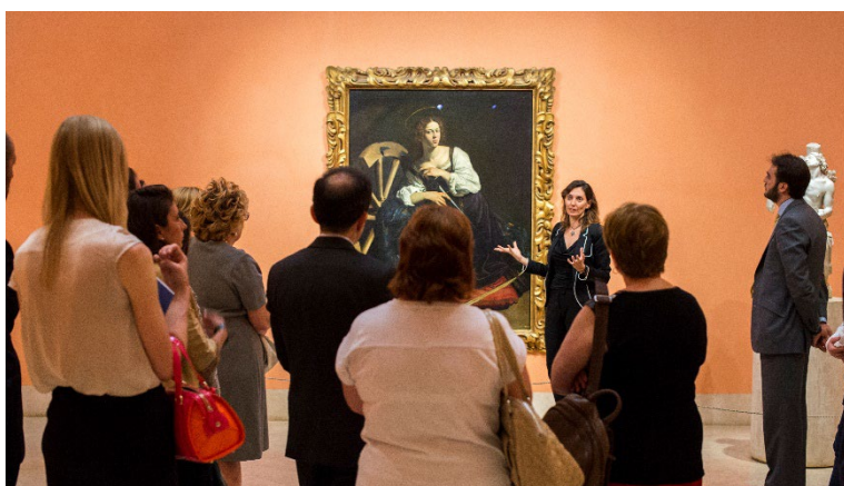
Private tours of the Thyssen-Bornemisza permanent collection and the Carmen Thyssen collection during summer opening hours and on Saturdays all year round, while the Cafeteria and temporary exhibitions remain open.